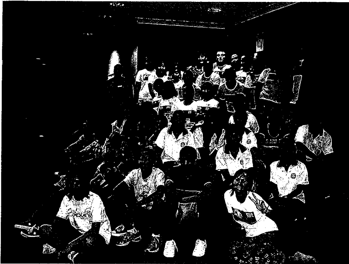
CDU SIFE Team and S4SC Competitors for 2010